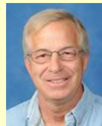
Ron Magnant Spas & Hot Tubs Water Chemistry 619-804-1759