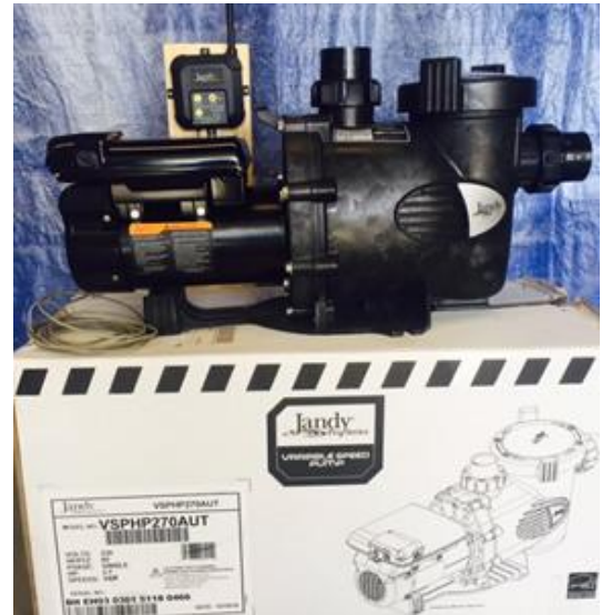
Jandy Variable Pump Model VSPHP270AUT 230 volt 2.7 HP, includes Jandy Controller IQ Pump 1 interface