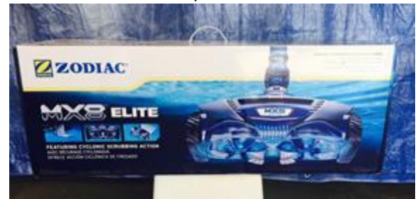
Zodiac MX8 Elite cleaner