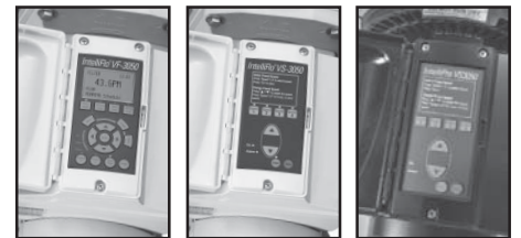
IntelliFlo VF-3050 IntelliFlo VS-3050 IntelliPro VS-3050