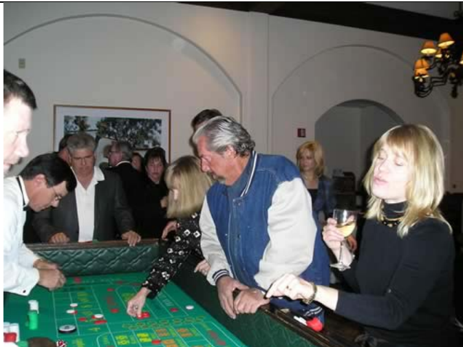
Lots of fun at the Casino Knights tables